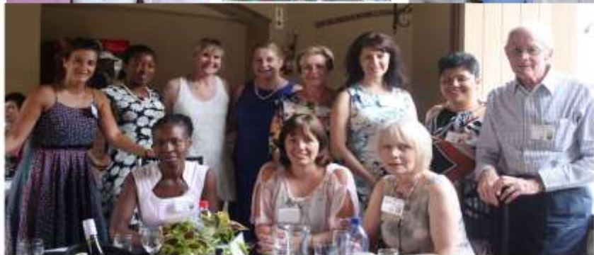
JHB Year End Lunch