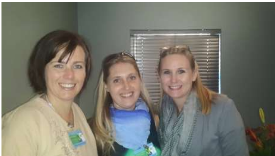
A review of some new actives launched.

The morning concluded with a key note presentation from Martin Hue of REACH 24H Consulting Group (via webinar) entitled China Cosmetic Regulation Introduction and Future Trends.